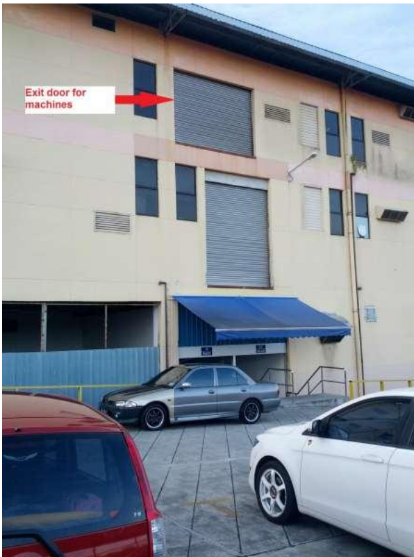
Figure 2: Close up view of exit door for machine at Plant 1 Tampoi, Johor